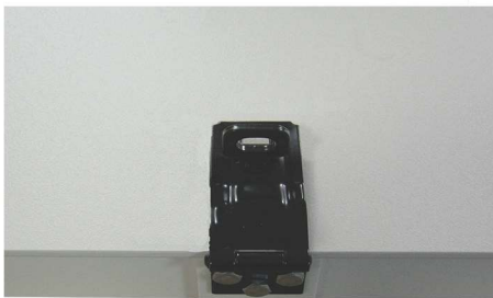
PADLOCKABLE SECURITY HASP